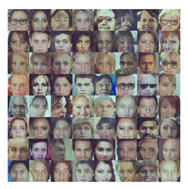
Figure 3: Examples of images, generated by SGAN after training for 8 epochs on the Celebrities dataset