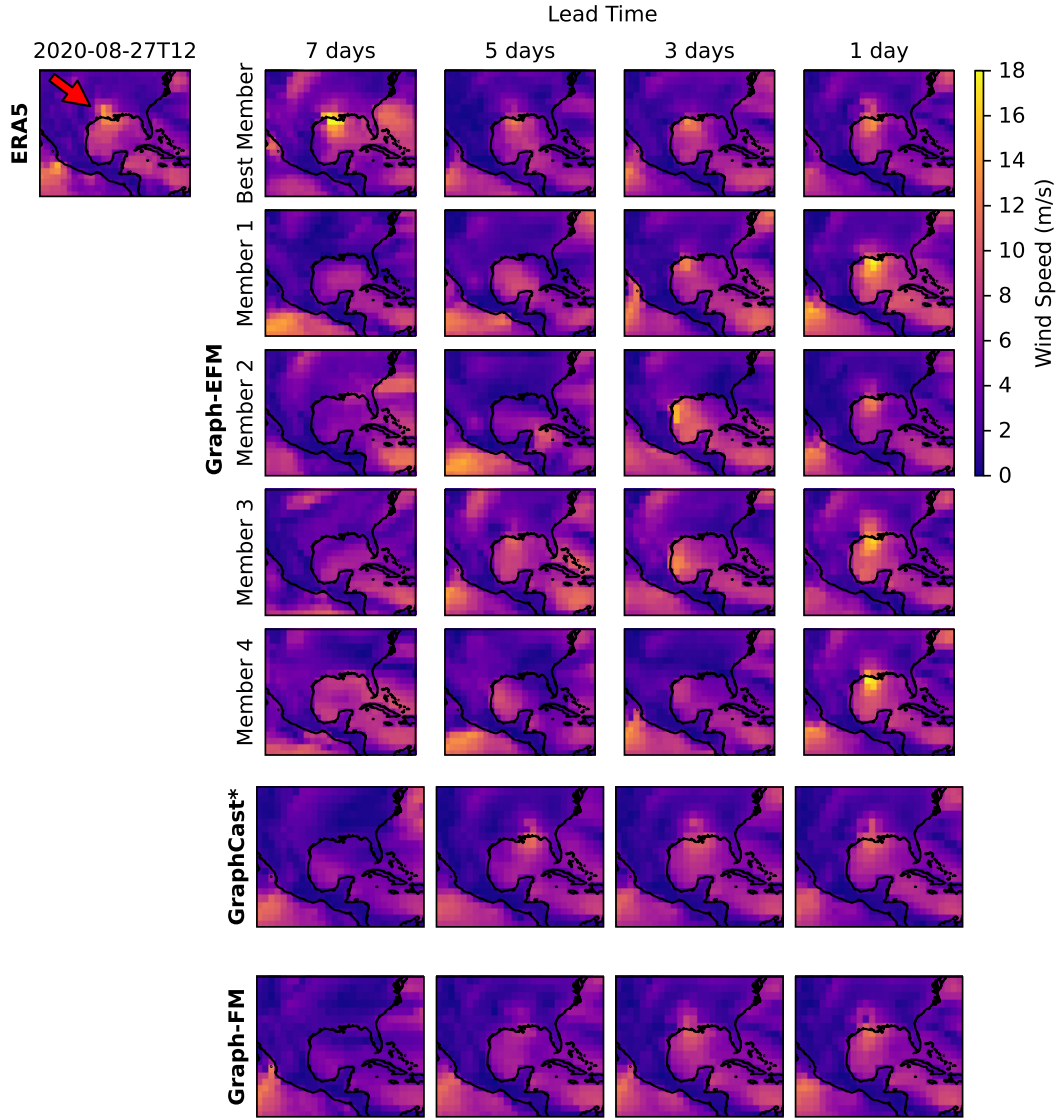
Figure 1: Example forecasts of 10 m wind speeds during hurricane Laura, all for 2020-08-27T12 UTC. The first column shows the wind speeds in ERA5, with the red arrow indicating the location of the hurricane. Remaining columns show model forecasts for the specific time, initialized at different lead times ahead. For Graph-EFM we plot both 4 randomly sampled ensemble members and one cherry-picked member that was deemed to best match ERA5.