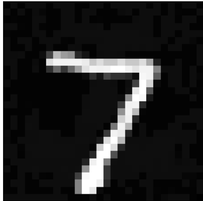
Carlini-Wagner Attack Prediction: 3