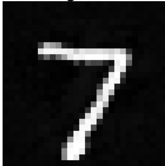
Carlini-Wagner (Pred.: 3)