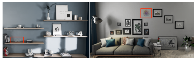
Figure 1: Object transpositions (gray wires on a shelf and paint splashes on a wall) demonstrating environmental harmony, fostering detachment from and acceptance of negative thoughts.