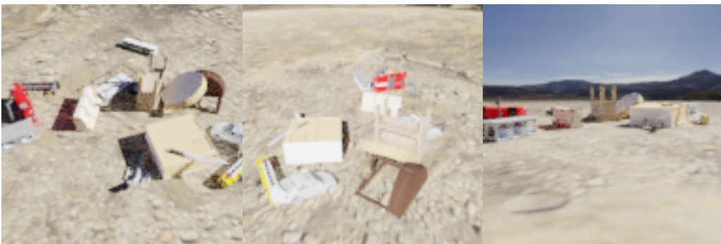
Ground-truth input views