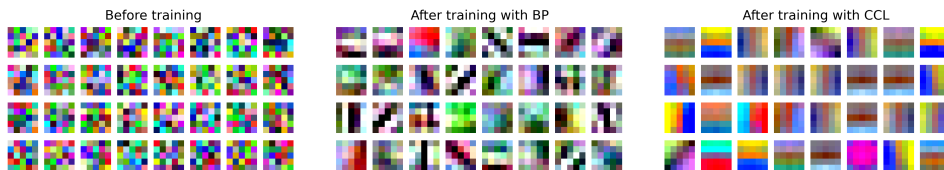
Figure 3: Reviewer sTDo [Q7].