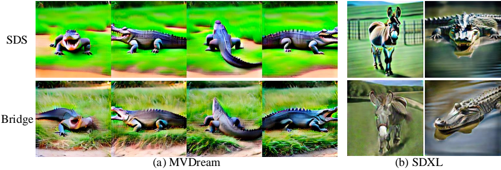
Figure A4: MVDream and SDXL. We compare SDS with our two-stage process in two new settings (MVDream & SDXL). The two-stage process produces more natural colors and realistic details.