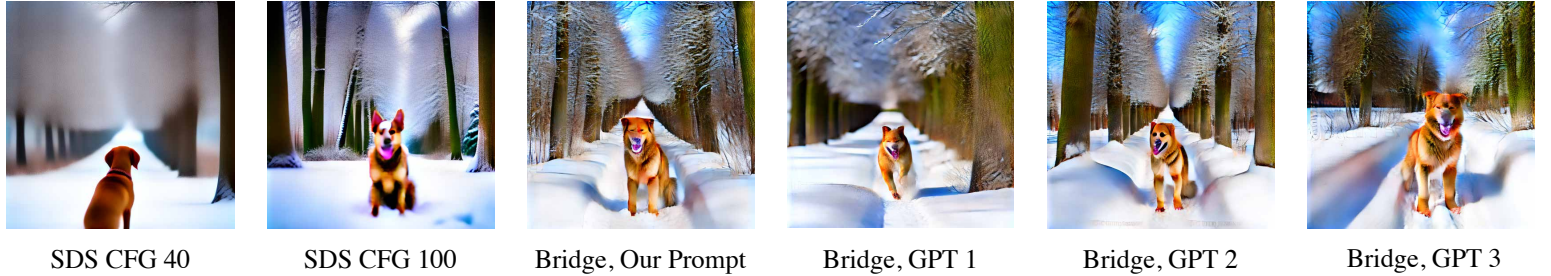
Figure A2: Ablation study of negative prompts. We compare SDS results with those from the two-stage optimization (bridge) using our negative prompts and the GPT-generated negative prompts (GPT 1 is the first, GPT 2 second, GPT 3 third). All negative prompts produce similar results and outperform the SDS baseline.