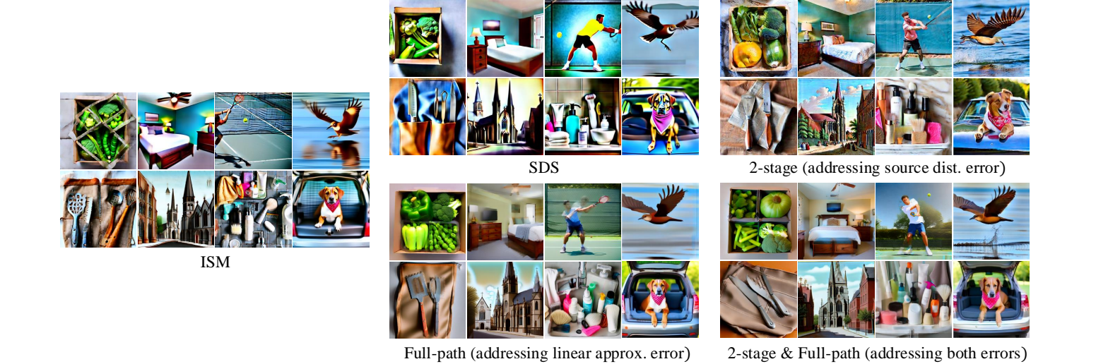
Figure A6: Reducing first-order approximation error improves generation quality. Using full PF-ODE simulation ("Full-path") to replace single-step prediction improves visual quality in all settings.