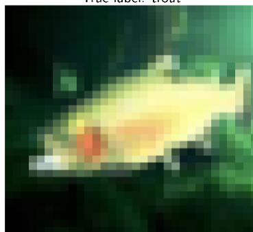
True label: trout

APS set: aquarium fish, bee, caterpillar, crab, dinosaur, lizard, shark, trout , turtle