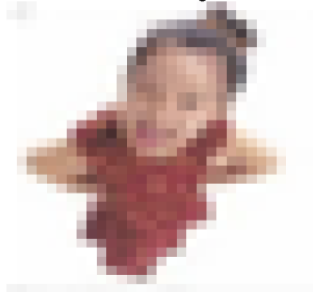
True label: girl

APS set: baby, beetle, bicycle, boy, cockroach, girl , hamster, motorcycle, mouse, seal EPIC set: baby, beetle, bicycle, boy, cockroach, girl , hamster, lobster, motorcycle, mouse, seal, trout