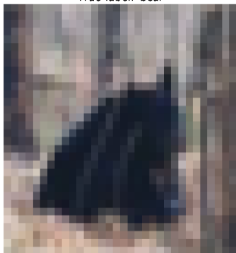
True label: bear

APS set: bear , beaver, caterpillar, chimpanzee, crocodile, elephant, forest, palm tree, possum, rabbit, willow tree