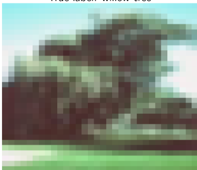
True label: willow tree

APS set: aquarium fish, bridge, castle, house, maple tree, pine tree, ray, shark, streetcar, sweet pepper, trout, turtle, whale, worm EPIC set: aquarium fish, boy, bridge, can, castle, crab, house, lobster, maple tree, oak tree, orchid, pine tree, ray, shark, streetcar, sunflower, sweet pepper, trout, turtle, whale, willow tree , worm