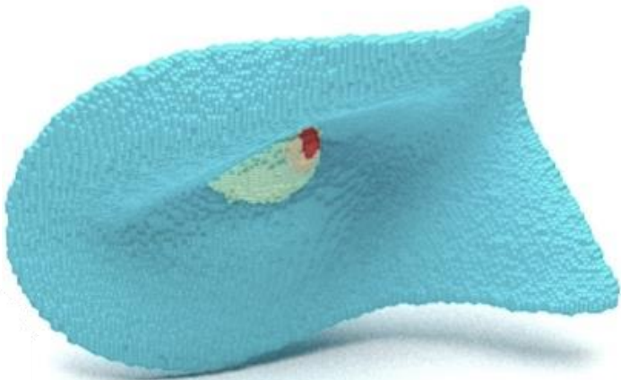
(b) Semantic Eye Completion