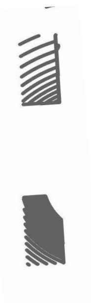
Cropped and greyscaled