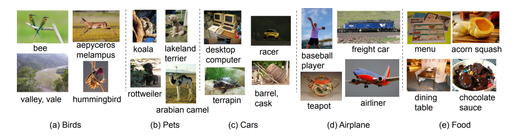
Figure 2: Representative examples from the source datasets with high weight from L2TL for different target datasets. In most cases, we observe them to be highly-related to the target dataset.

Analysis of high-weight source samples: To build insights on the learned weights, we sample 10k actions from the policy and rank the source labels according to their weights. Table 3 shows the classes with the highest weights and Fig. 2 visualize a few representative examples from them. These demonstrate that L2TL can judiciously extract the related classes from the source based on the pattern/shape of the objects, or background scenes.