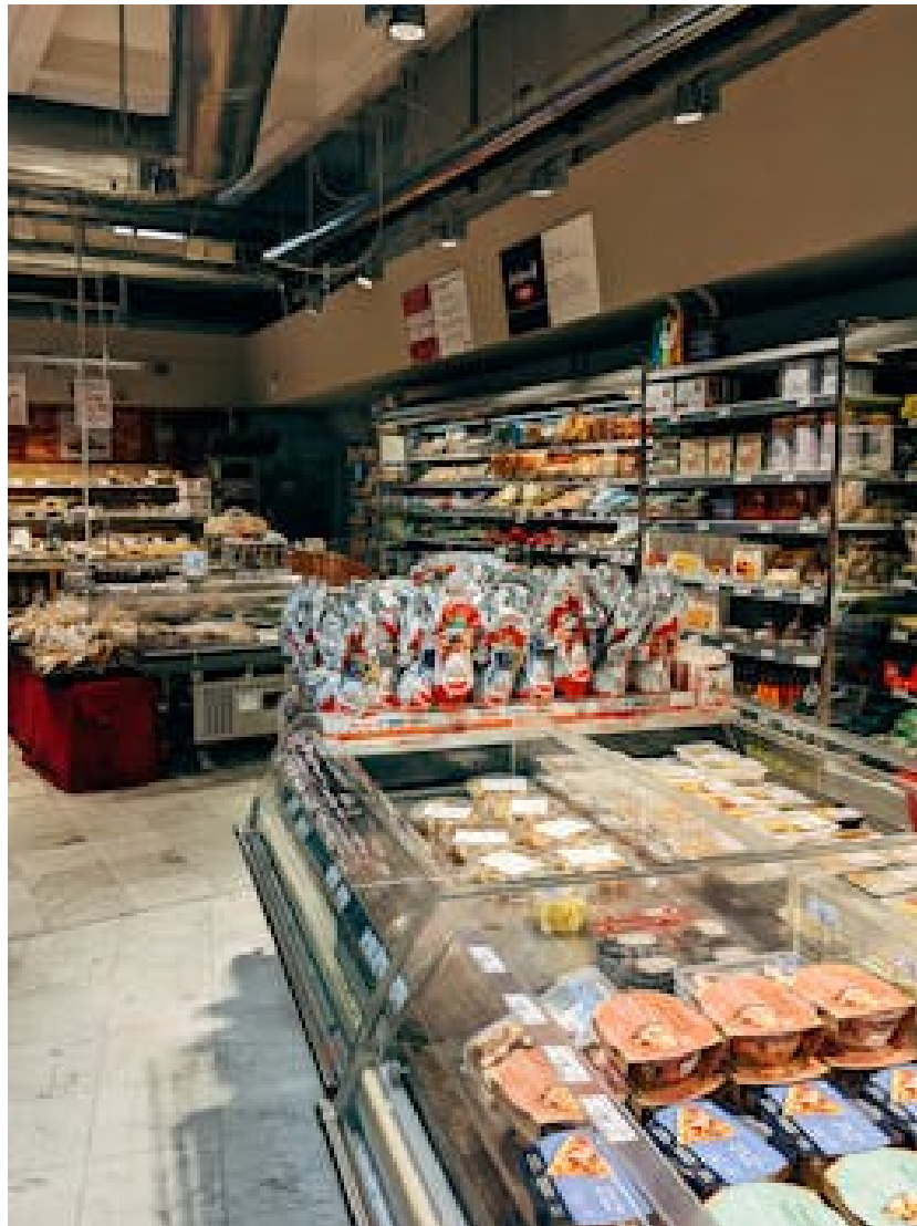
Figure 3: A variety of pasta products ready for distribution.