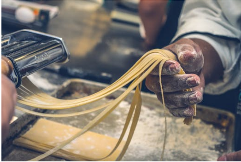
Figure 1: Fresh ingredients used in pasta making.