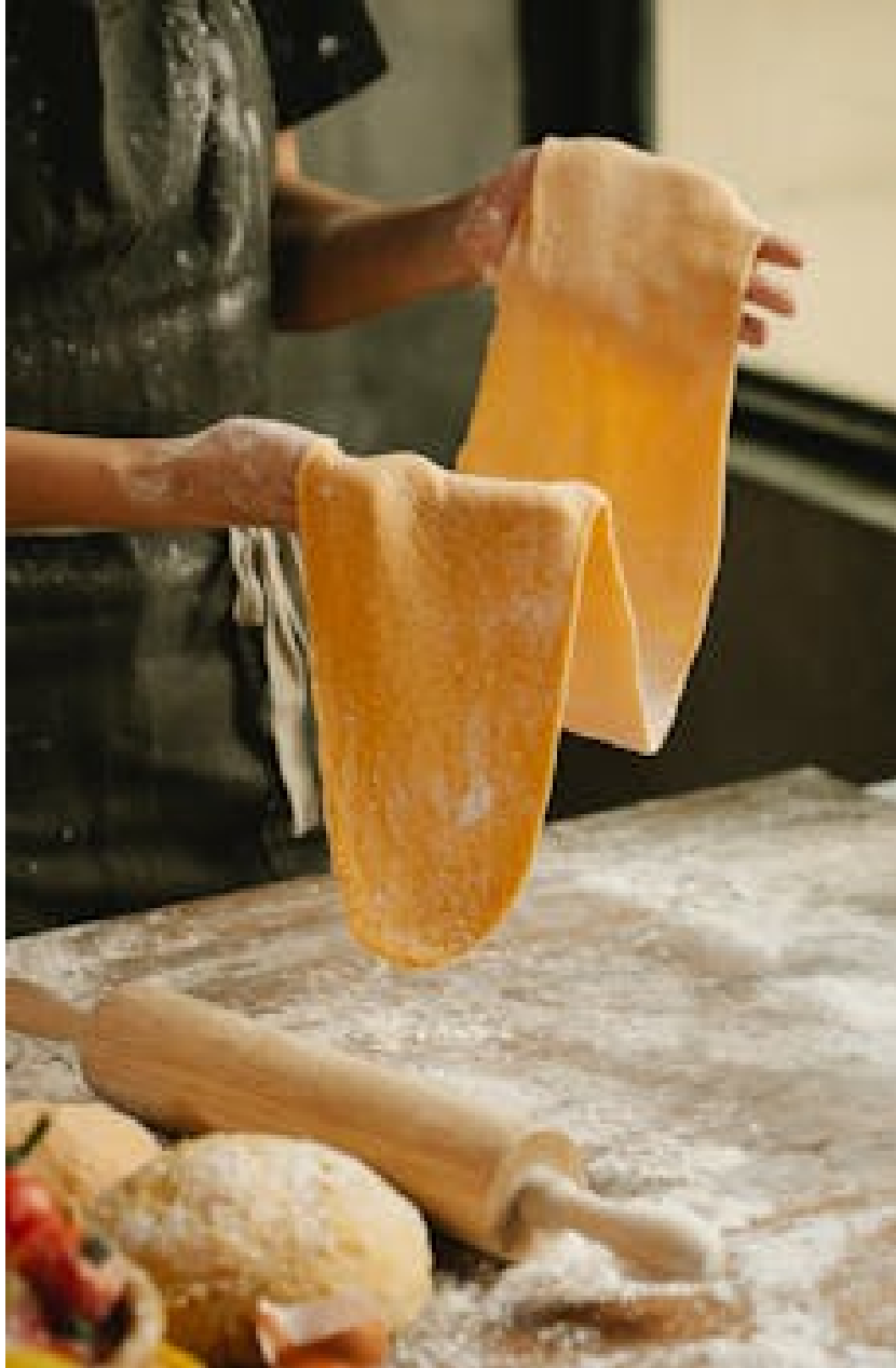
Figure 2: Artisan pasta being shaped by hand.