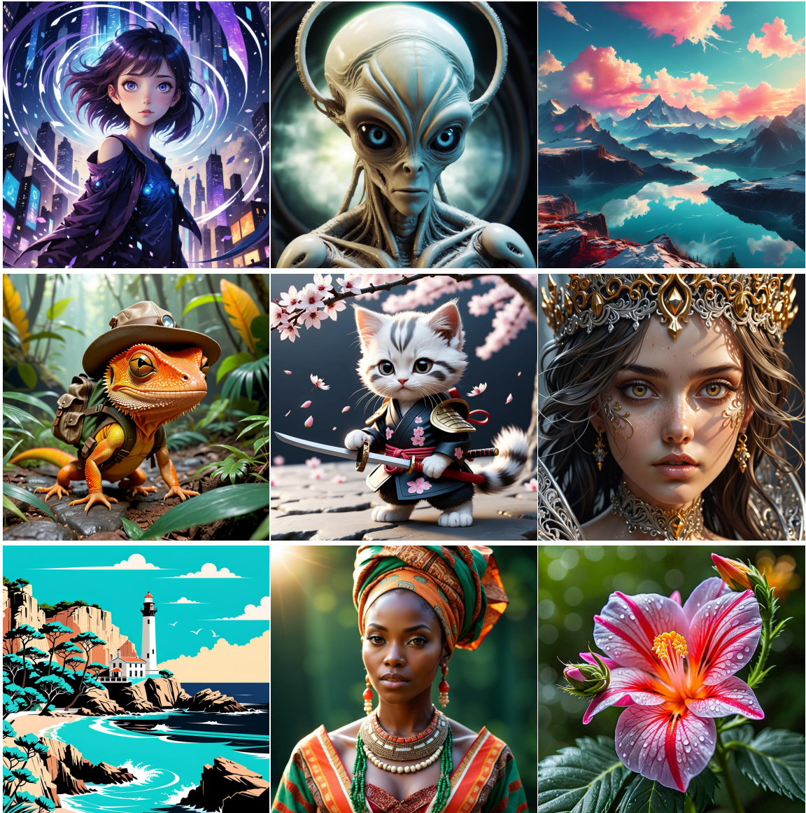
Figure 1: Curated images generated using ComfyGen-ICL. The list of prompts is available in the supplementary.