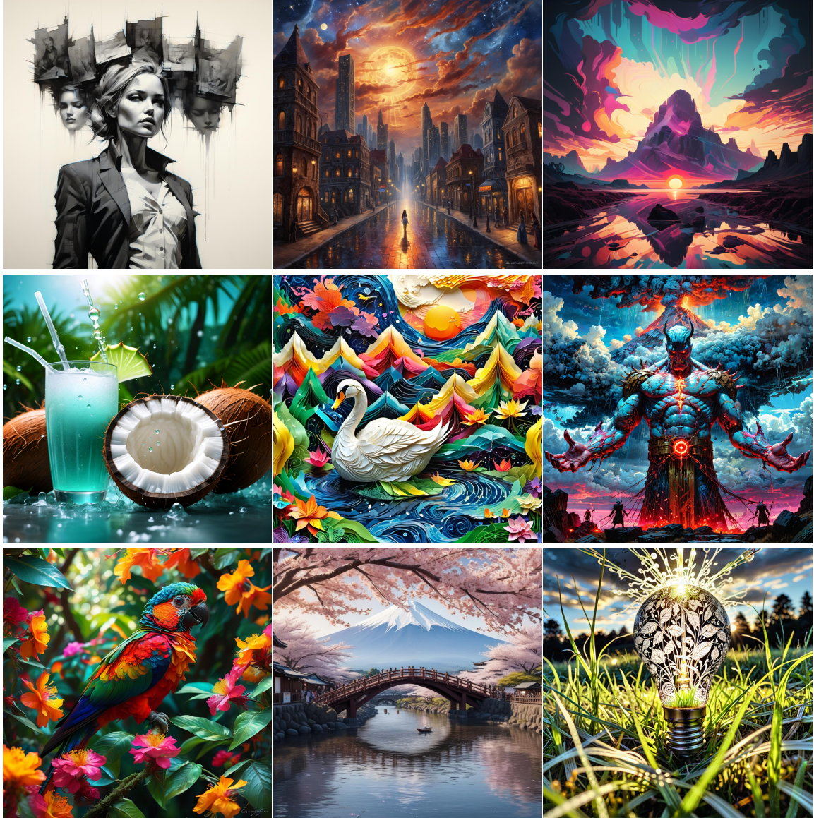
Figure 4: Curated images generated using ComfyGen-FT. The list of prompts is available in the supplementary.