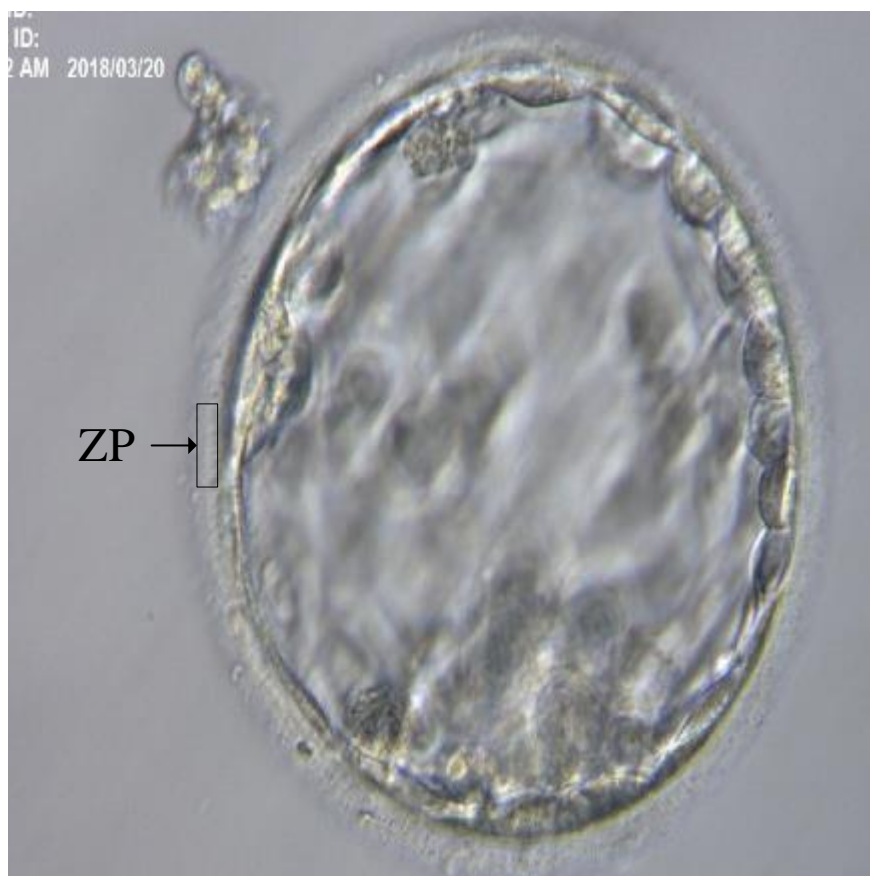
(b1) Negative Blastocyst: stage