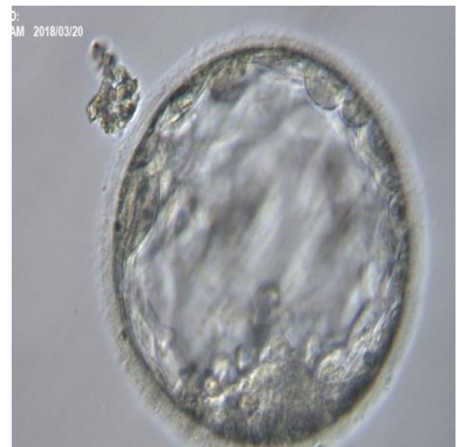
(b3) Negative Blastocyst: TE