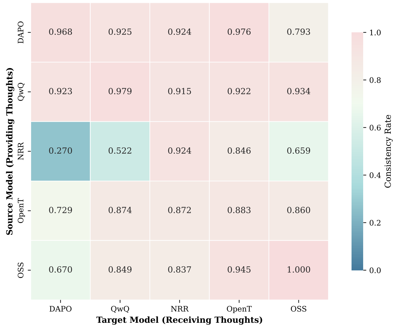
Model-to-Model Consistency Matrix