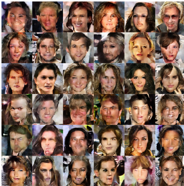
Figure 12: One-step samples on CelebA-HQ 256 \times 256 (L2 loss)