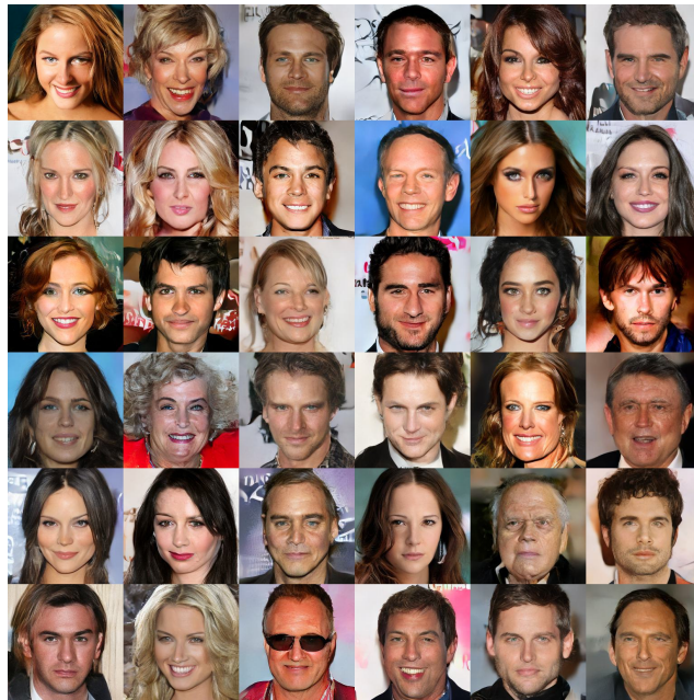
Figure 6: One-step samples on CelebA-HQ 256 \times 256

We provide additional uncurated samples of our models for three datasets: CelebA-HQ (6, 7), LSUN Church (8, 9), and FFHQ (10, 11). We also provide additional uncurated samples of our models on CelebA-HQ trained with L2 loss (12) and E-LatentLPIPS loss (13).