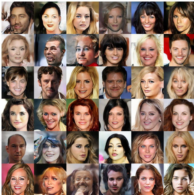
Figure 13: One-step samples on CelebA-HQ 256 \times 256 (E-LatentLPIPS loss)