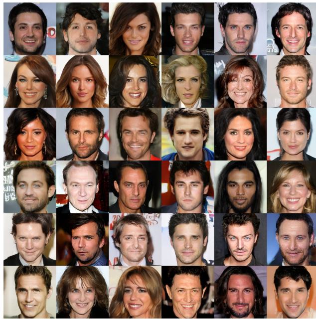
Figure 7: Two-step samples on CelebA-HQ 256 \times 256