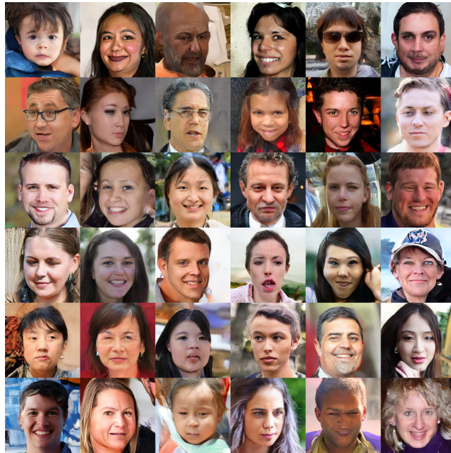
Figure 10: One-step samples on FFHQ 256 \times 256