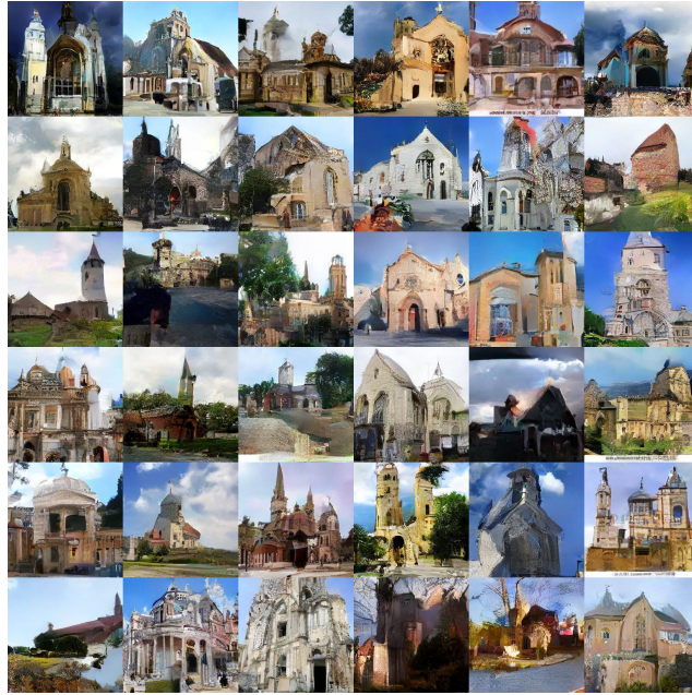
Figure 8: One-step samples on LSUN Church 256 \times 256