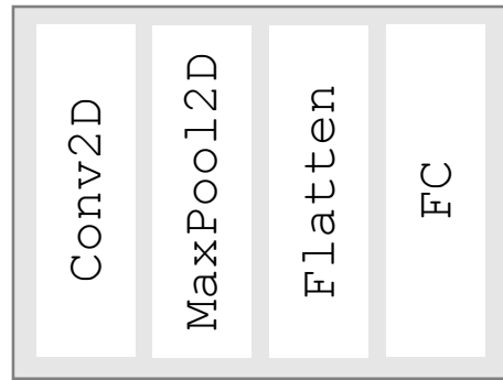
CNN - Classification