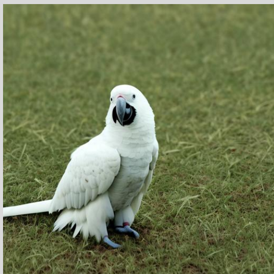
Hard Caption: A photo of a white parrot on a grass field