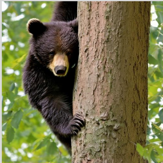
Hard Caption: A photo of a bear cub climbing a tree