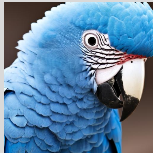
Easy Caption: A close-up photo of a blue parrot