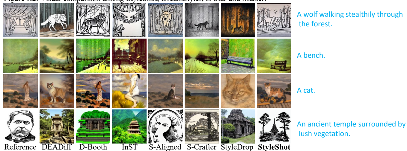
Figure R4: Qualitative comparison with SOTA text-driven style transfer methods on third-party bench from [1].