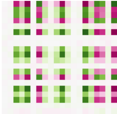
Feature Channel 1