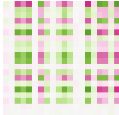
Feature Channel 1