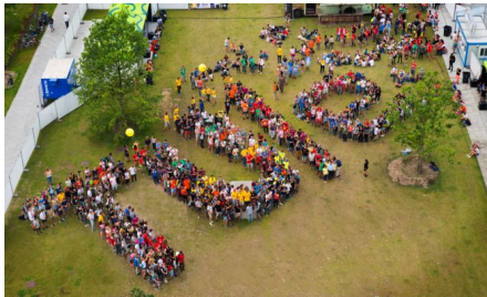
Figure 2: A View of a Nice City.