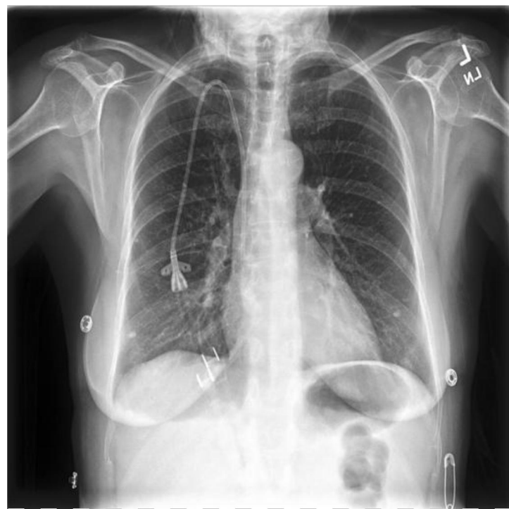
Original Image [With Medical Devices]