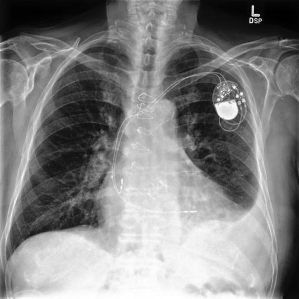
Original Image [Cardiomegaly] [Pleural Effusion]