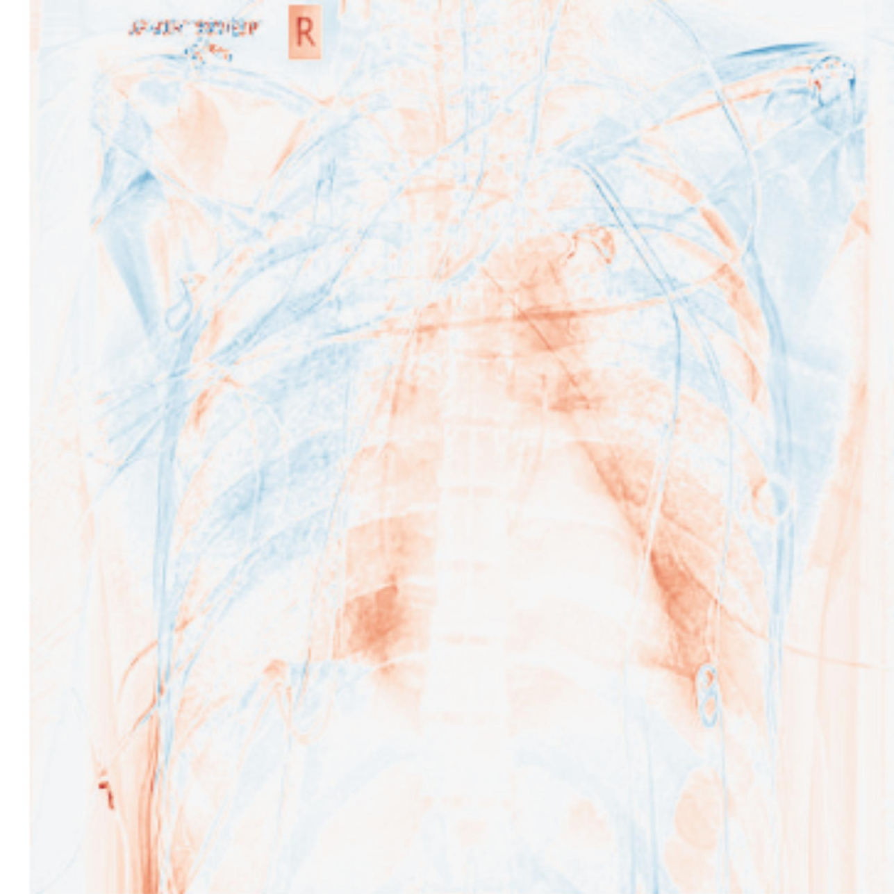
(b) Difference map

Edit Text: chest xray of the patient with no finding