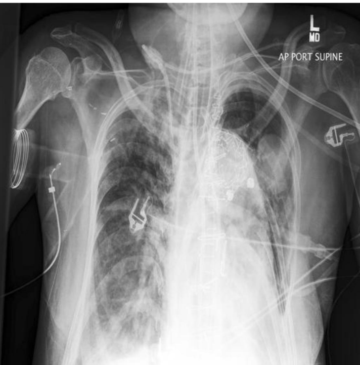
Original Image [With Medical Devices]