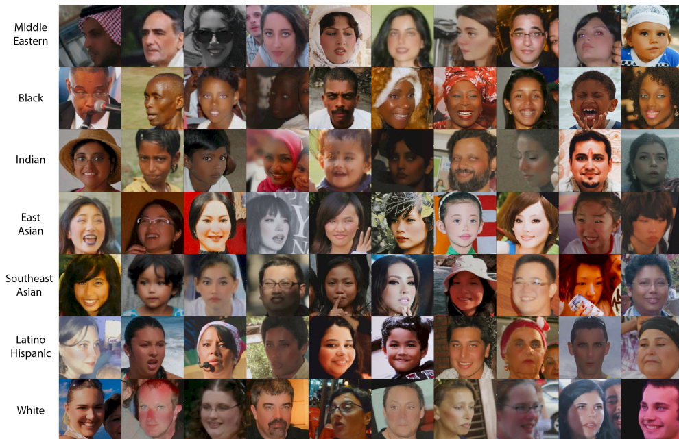
Figure 6: Examples of 70 different individuals in the FAIRBEAUTY dataset, divided by row according to the value of the label race.

The intended uses of our datasets (FAIRBEAUTY and B-LFW) are very wide. Among the possibilities, we mention investigating the influence of beauty filters on social constructs, both computationally and through user studies. A second direction concerns societal implications of beauty filters. For example, these filters have raised concerns regarding existing biases in the automatic beautification practices and have been widely criticized for perpetuating racism and colorism. FAIRBEAUTY, in particular, opens the possibility of studying such issues computationally. As an insight, in Figure 6, we report exemplary images from FAIRBEAUTY, divided according to the label race in the original FAIRFACE dataset.