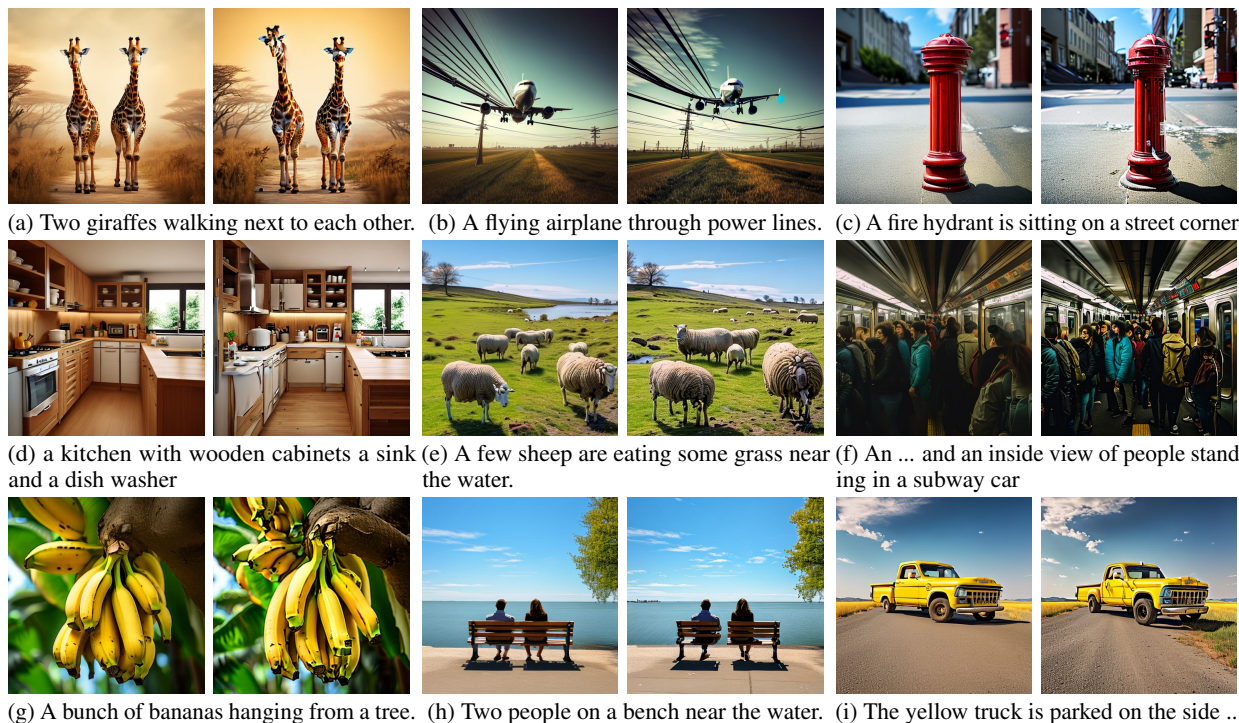
Figure 5: Comparison between L2C (left) and DPM-Solver (right) on PixArt-XL-2-512x512. Zoom in to see the details.