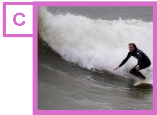
1 A man surfing in a body of water.