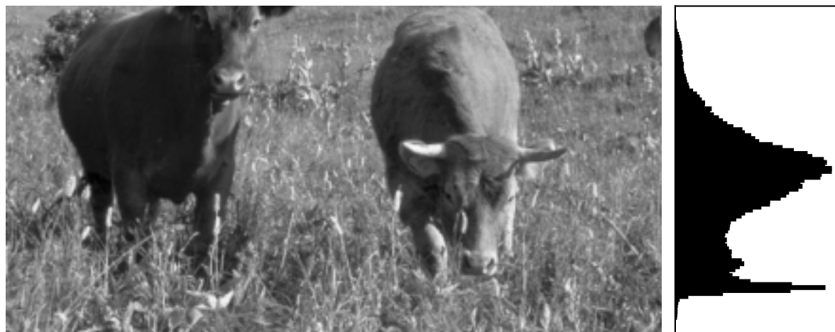
Recovered source 1