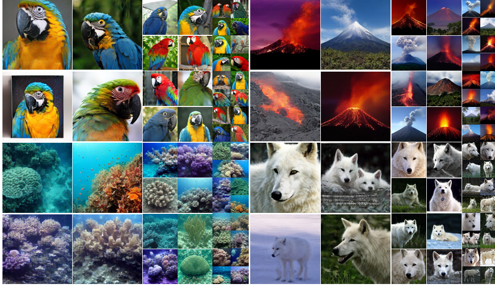
Figure 1: Uncurated 256 \times 256 TiTok-L-32 samples. Class labels (class ids) from left to right and top to down are: “macaw” (88), “volcano” (980), “coral reef” (973), “white wolf” (270).