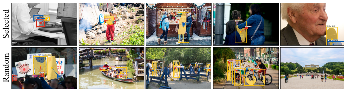
Figure 4: Qualitative results on SAM dataset. Row 1 is selected results and row 2 is random.