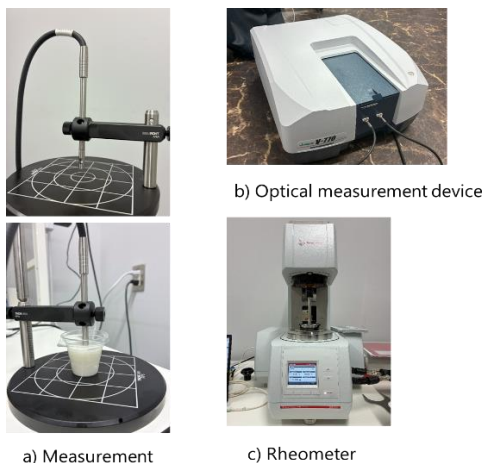
Fig. 2: Experimental set up

The experimental setup is shown in Figure 2. The test equipment is mainly composed of a mixer as experiment and a) Probe b)optical measurement device and c)Rheometer as viscosity measurement.