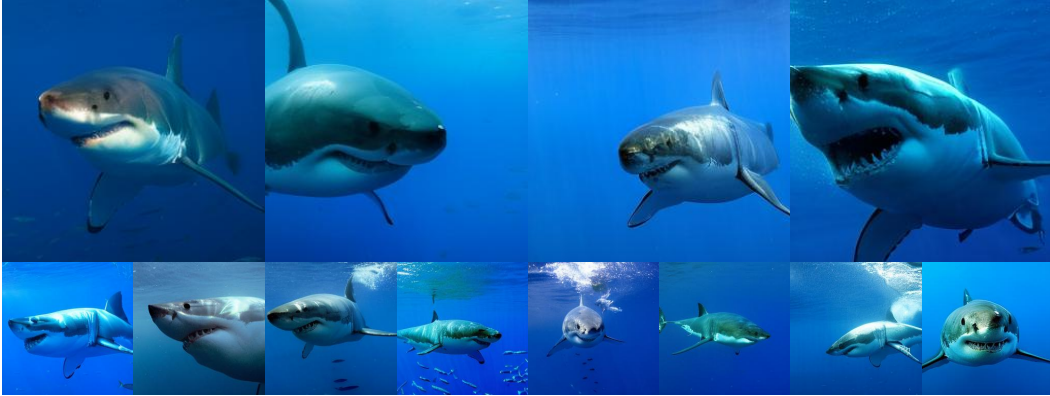
Figure 6: The visualization results of SiT-XL/2 + REG use CFG with w = 4.0 , and the class label is “Great white shark” (2).