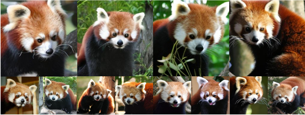
Figure 17: The visualization results of SiT-XL/2 + REG use CFG with w = 4.0 , and the class label is “Lesser panda” (387).