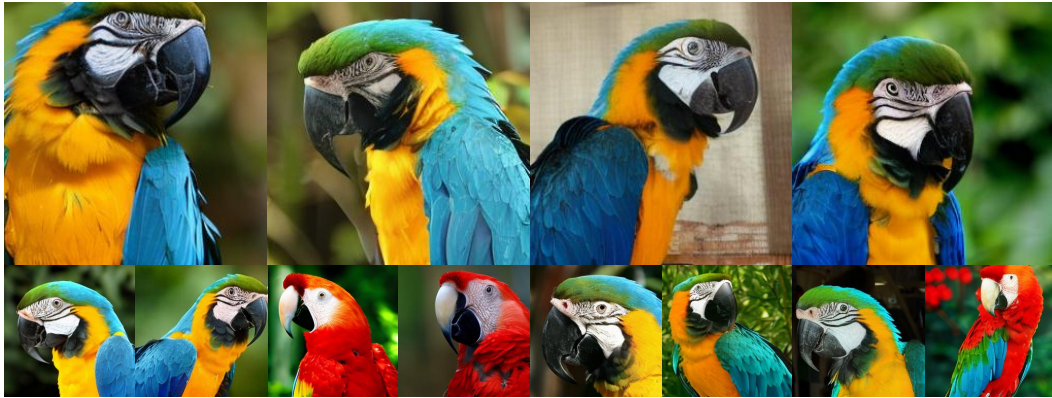
Figure 9: The visualization results of SiT-XL/2 + REG use CFG with w = 4.0 , and the class label is “Macaw” (88).