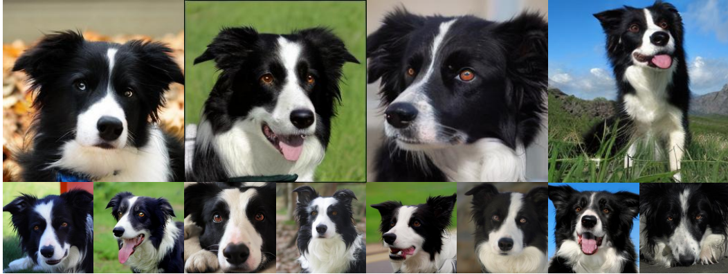
Figure 14: The visualization results of SiT-XL/2 + REG use CFG with w = 4.0 , and the class label is “Border collie” (232).