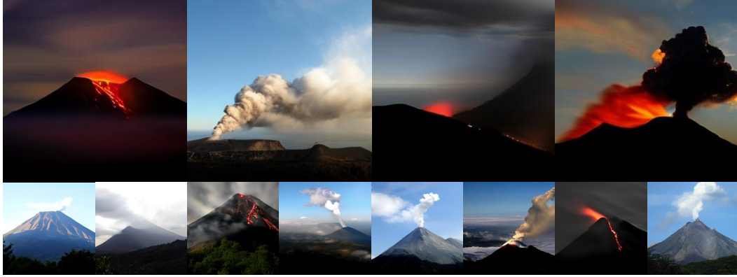
Figure 25: The visualization results of SiT-XL/2 + REG use CFG with w = 4.0 , and the class label is “Volcano” (980).