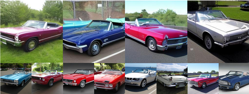
Figure 21: The visualization results of SiT-XL/2 + REG use CFG with w = 4.0 , and the class label is “Convertible” (511).