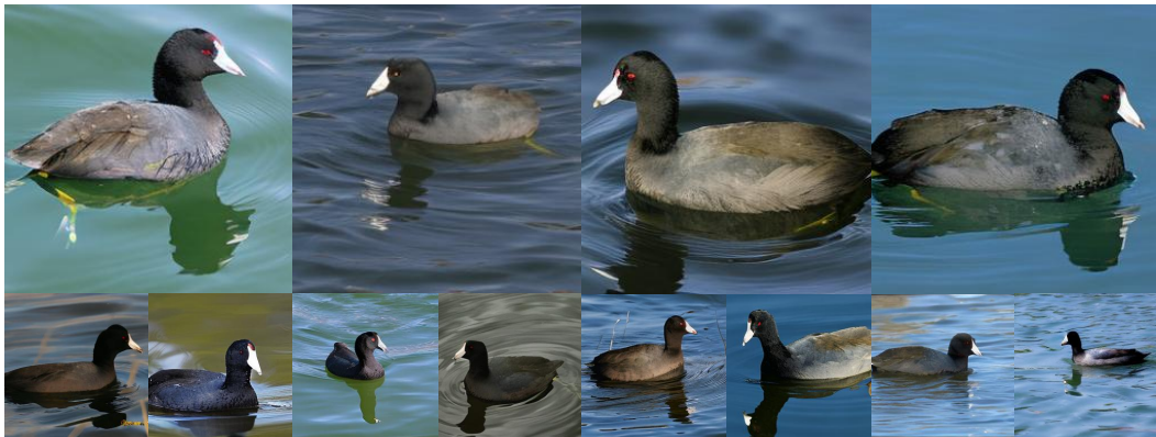
Figure 12: The visualization results of SiT-XL/2 + REG use CFG with w = 4.0 , and the class label is “American coot” (137).