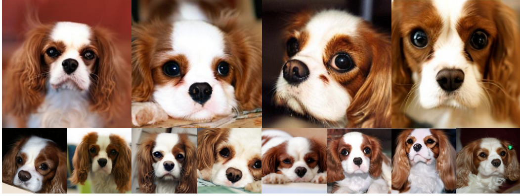
Figure 13: The visualization results of SiT-XL/2 + REG use CFG with w = 4.0 , and the class label is “Lesser panda” (156).