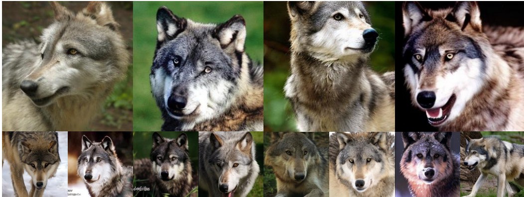
Figure 15: The visualization results of SiT-XL/2 + REG use CFG with w = 4.0 , and the class label is “Timber wolf” (269).