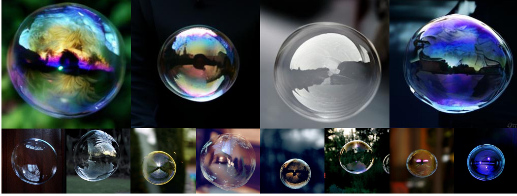
Figure 22: The visualization results of SiT-XL/2 + REG use CFG with w = 4.0 , and the class label is “Bubble” (971).