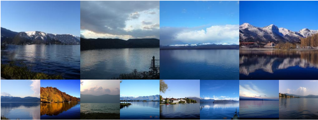
Figure 24: The visualization results of SiT-XL/2 + REG use CFG with w = 4.0 , and the class label is “Lakeside” (975).