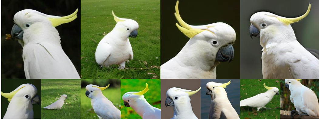
Figure 10: The visualization results of SiT-XL/2 + REG use CFG with w = 4.0 , and the class label is “Sulphur-crested cockatoo” (89).