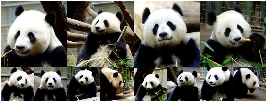
Figure 18: The visualization results of SiT-XL/2 + REG use CFG with w = 4.0 , and the class label is “Giant panda” (388).