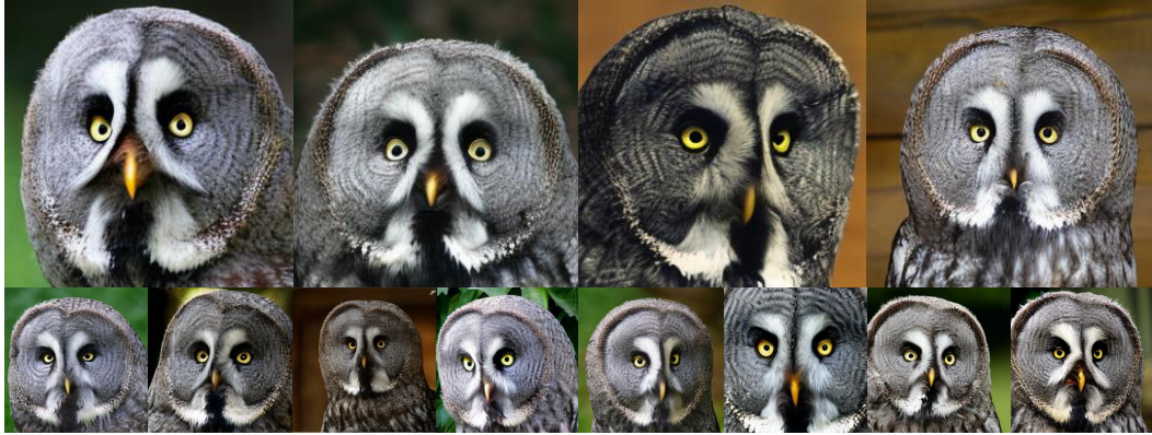
Figure 8: The visualization results of SiT-XL/2 + REG use CFG with w = 4.0 , and the class label is “Great grey owl” (24).