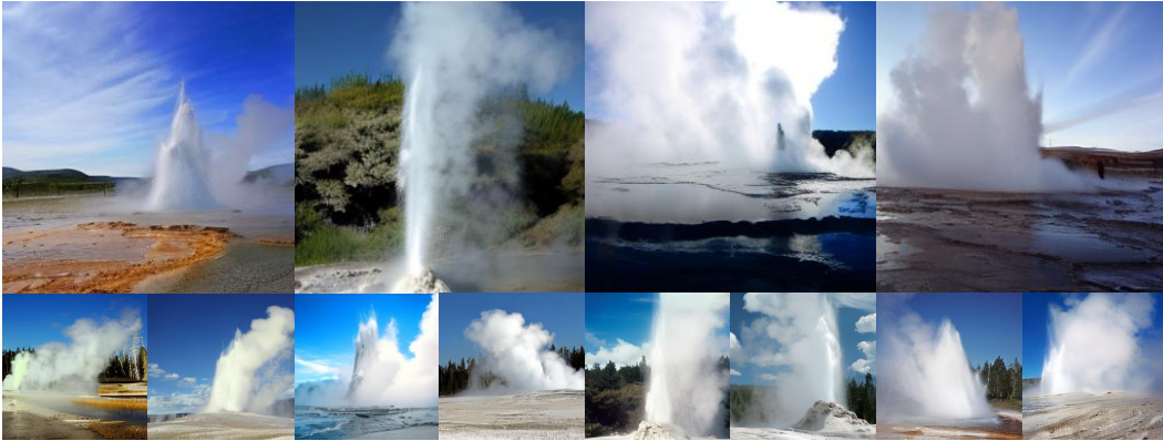
Figure 23: The visualization results of SiT-XL/2 + REG use CFG with w = 4.0 , and the class label is “Geyser” (974).