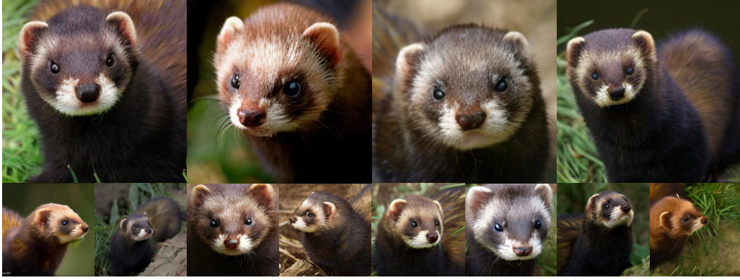
Figure 16: The visualization results of SiT-XL/2 + REG use CFG with w = 4.0 , and the class label is “Polecat” (358).