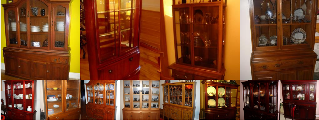
Figure 20: The visualization results of SiT-XL/2 + REG use CFG with w = 4.0 , and the class label is “China cabinet” (495).