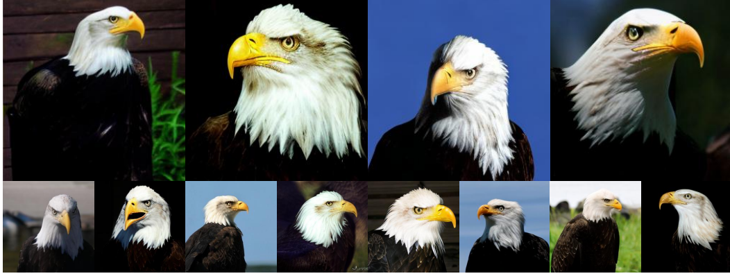
Figure 7: The visualization results of SiT-XL/2 + REG use CFG with w = 4.0 , and the class label is “Bald eagle” (22).