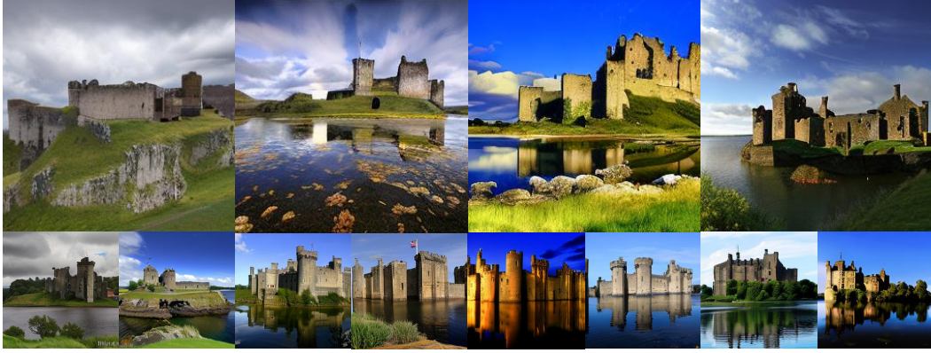
Figure 19: The visualization results of SiT-XL/2 + REG use CFG with w = 4.0 , and the class label is “Castle” (483).