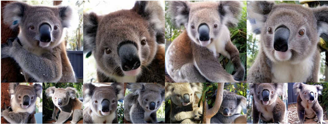
Figure 11: The visualization results of SiT-XL/2 + REG use CFG with w = 4.0 , and the class label is “Koala” (105).