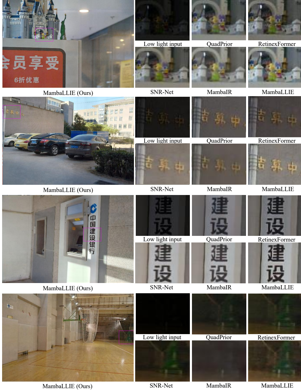
Figure 7: More qualitative comparisons with SOTAs.(Zoom in for best view)