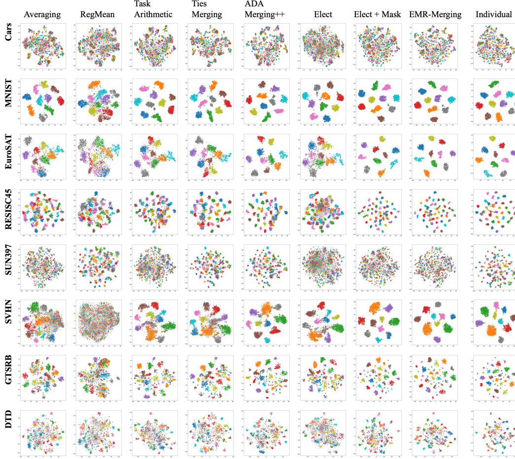
Figure 8: t-SNE visualization results of different merging methods.