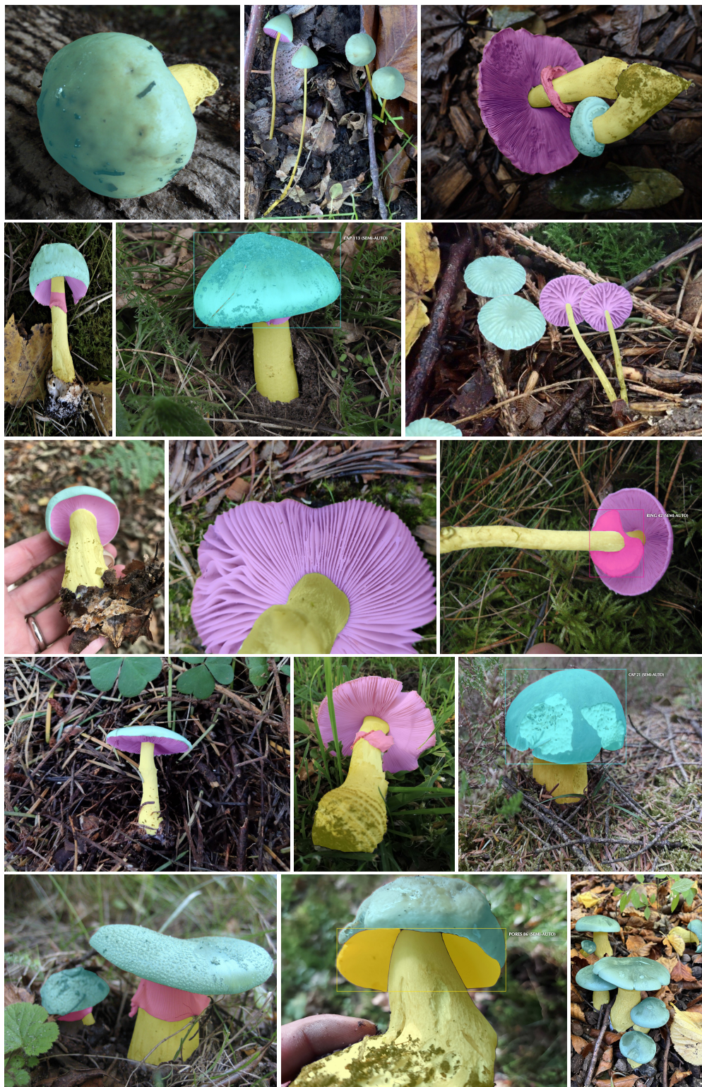
Figure 2: Additional samples of fruiting body part segmentation.