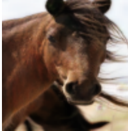
P_{0.5}(w) \rightarrow Q_{12}(w, f)