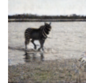
Q_{12}(w, f) \rightarrow P_{0.5}(w, f)