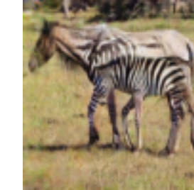
P_{0.5}(w, f) \rightarrow Q_{12}(w, f)