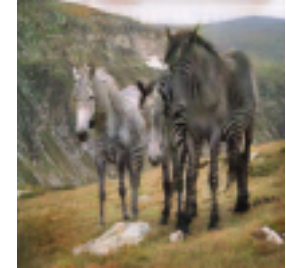
P_{0.5}(w) \rightarrow Q_{12}(w, f)