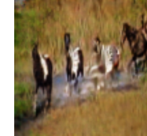
P_{0.5}(w, f) \rightarrow Q_{12}(w, f)