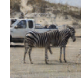
Q_{12}(w, f) \rightarrow P_{0.5}(w, f)