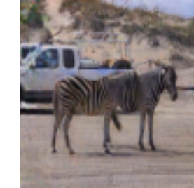
P_{0.5}(w, f) \rightarrow Q_{12}(w, f)