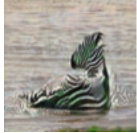
P_{0.5}(w) \rightarrow Q_{12}(w, f)