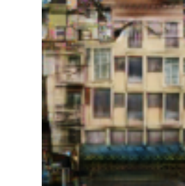
Q_8(w, f) \rightarrow P_{0.5}(w, f)