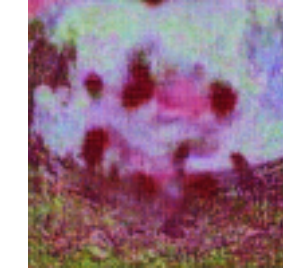
P_{0.5}(w) \rightarrow Q_8(w, f)