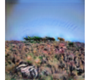
P_{0.5}(w) \rightarrow Q_{12}(w, f)