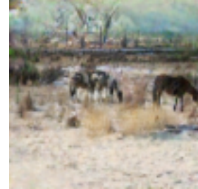
P_{0.5}(w, f) \rightarrow Q_{12}(w, f)