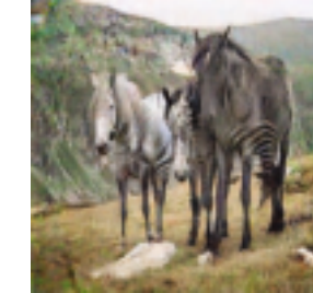
P_{0.5}(w, f) \rightarrow Q_{12}(w, f)