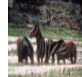
P_{0.5}(w, f) \rightarrow Q_{12}(w, f)