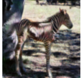
P_{0.5}(w) \rightarrow Q_{12}(w, f)