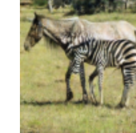
Q_{12}(w, f) \rightarrow P_{0.5}(w, f)