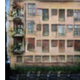
P_{0.5}(w) \rightarrow Q_8(w, f)