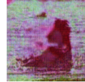
P_{0.5}(w) \rightarrow Q_8(w, f)