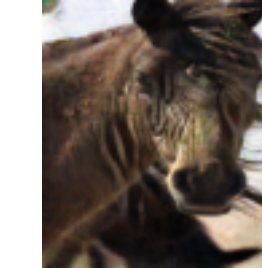
P_{0.5}(w, f) \rightarrow Q_{12}(w, f)