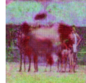
P_{0.5}(w) \rightarrow Q_8(w, f)