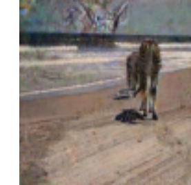
P_{0.5}(w, f) \rightarrow Q_{12}(w, f)