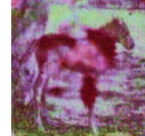
P_{0.5}(w) \rightarrow Q_8(w, f)