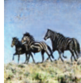
Q_{12}(w, f) \rightarrow P_{0.5}(w, f)