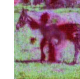
P_{0.5}(w) \rightarrow Q_8(w, f)