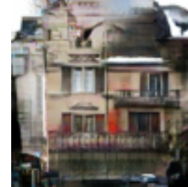
Q_8(w, f) \rightarrow P_{0.5}(w, f)