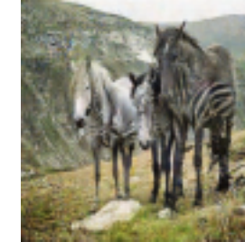
Q_{12}(w, f) \rightarrow P_{0.5}(w, f)