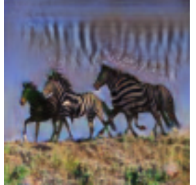
P_{0.5}(w) \rightarrow Q_{12}(w, f)