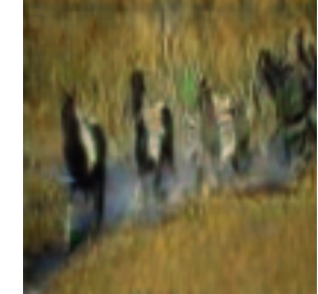
P_{0.5}(w) \rightarrow Q_{12}(w, f)