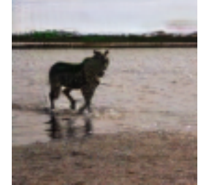
P_{0.5}(w) \rightarrow Q_{12}(w, f)