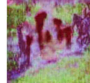
P_{0.5}(w) \rightarrow Q_8(w, f)