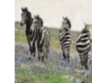
Q_{12}(w, f) \rightarrow P_{0.5}(w, f)