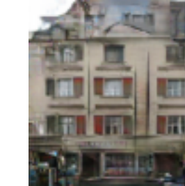
Q_8(w, f) \rightarrow P_{0.5}(w, f)