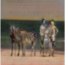
P_{0.5}(w) \rightarrow Q_{12}(w, f)