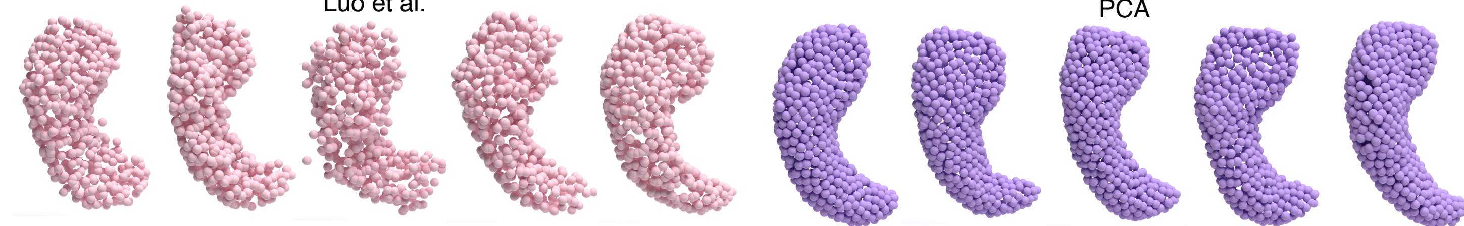
Zeng et al.