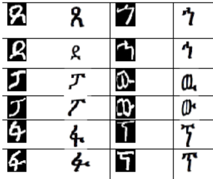
Figure 3: Different characters written similarly.