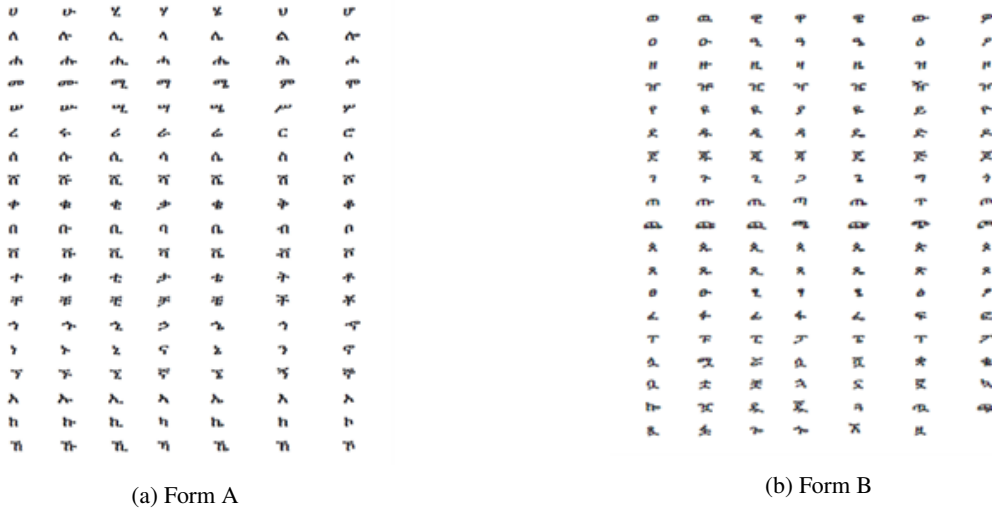
Figure 2: Data collection forms for Amharic characters

The collected data was labelled based on the 265 classes for each character by using integer values 0 to 264 for each class of the character. The disadvantage of convolutional neural network is its rapacious appetite for labelled training data. Hence, real-world data collection and applying image pre-processing methods are needed to make the system more robust and efficient. A large handwritten character dataset have been collected in our work and labelled to train as well as to evaluate the system performance compared with other researcher works for Amharic character recognition system.