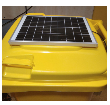
(b) Solar panel