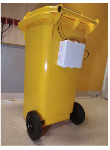
(a) Distribution box with microcontroller, voltage regulator with battery, GPS and LoRa modules