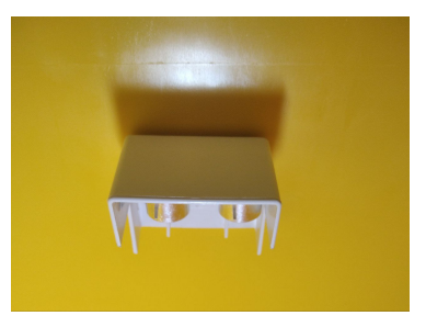
(d) Range sensor