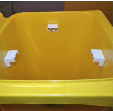
(c) Range sensors inside the bin box