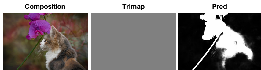
Figure D: Illustration of the Necessity of Trimap. Demonstration with multiple foreground objects, showing how the absence of a trimap leads to confusion.