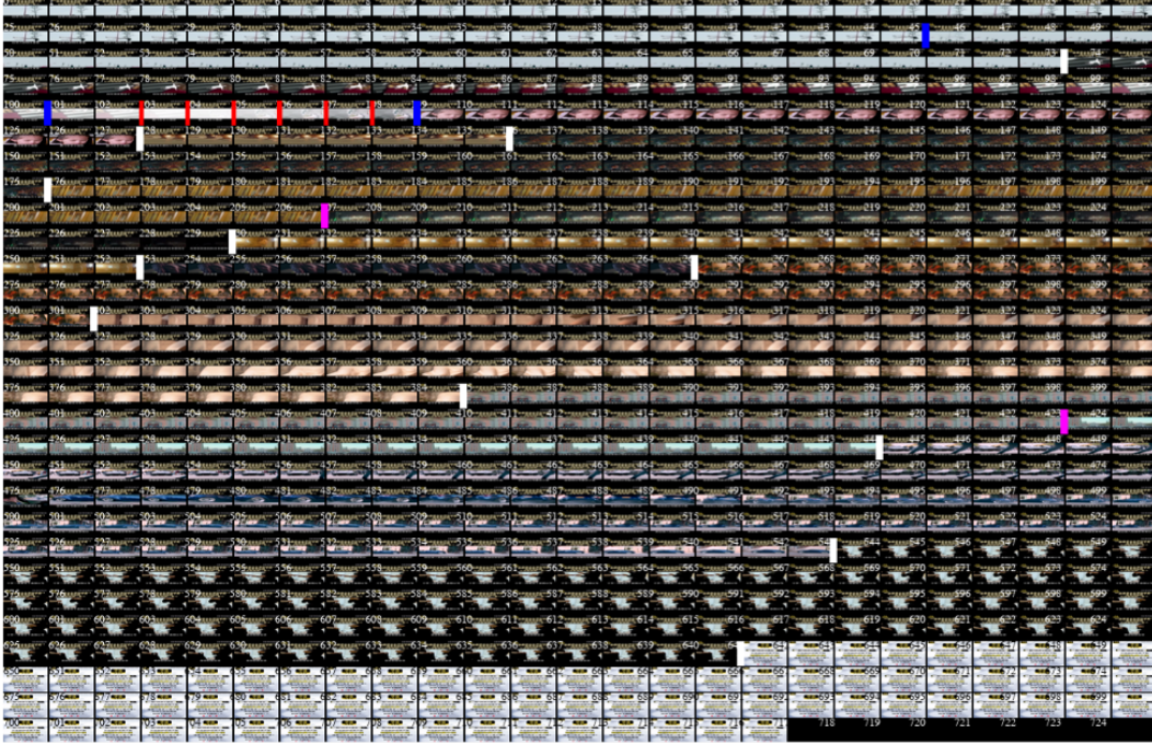
Figure 3: A thumbnail image for the same video as Figure 2. Light, red and pink colors mark the ground truth shot boundary annotation. The yellow circle denotes one gradual transition from frame 102 to frame 108.

script can be found in https://github.com/soCzech/TransNetV2/blob/master/training/metrics_utils.py#L26 .