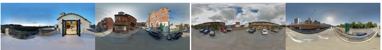
Fig 1. Generalibility of DiffPano (Outdoor)