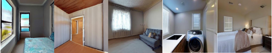
Fig 6. ERP to perspective view