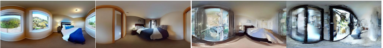
Fig 5. Two-stage vs One-stage (left-two: two-stage, right-two: one-stage)