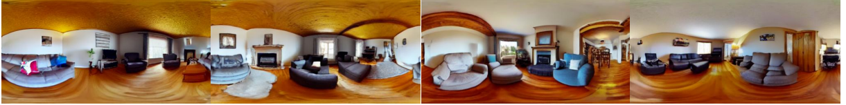
Fig 3. Diversity of DiffPano (same prompt,diverse output )