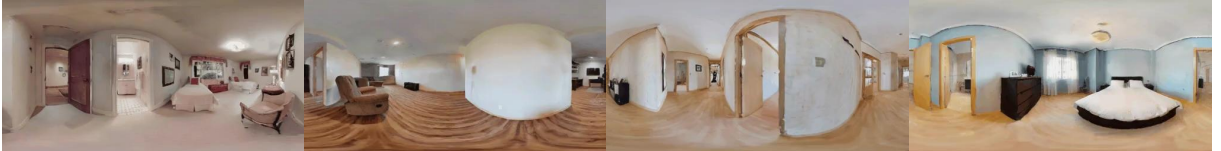
Fig 2. Scalability of DiffPano (room switching )