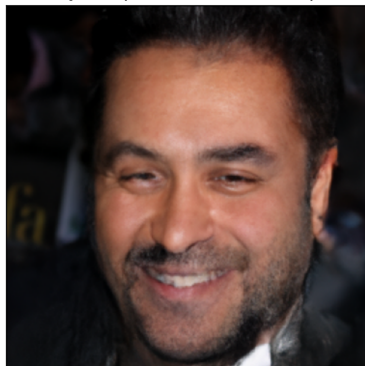
QAVI (Reduced model)