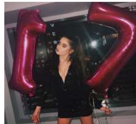
lowkey miss this outfit and this night