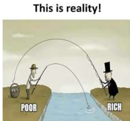
this is reality ... lol