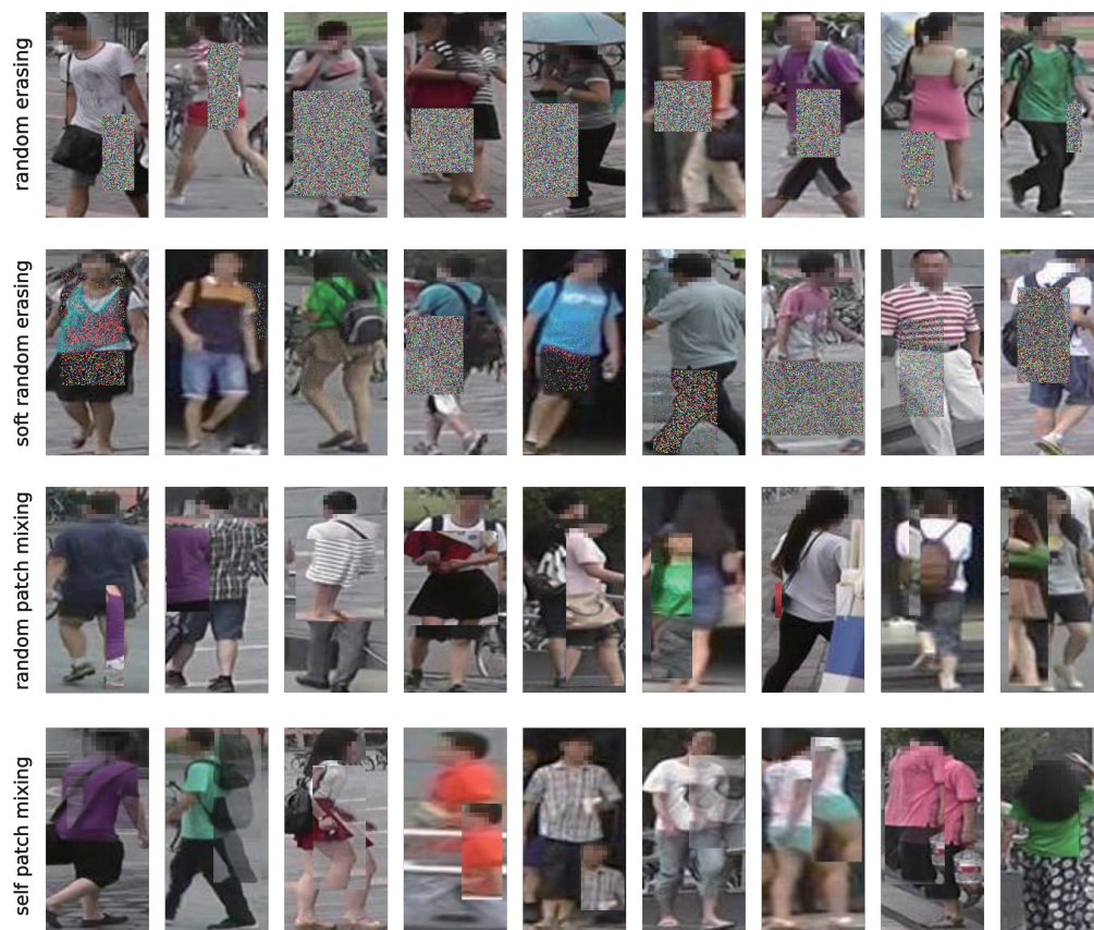
Figure 1: Visualization of different augmented examples.