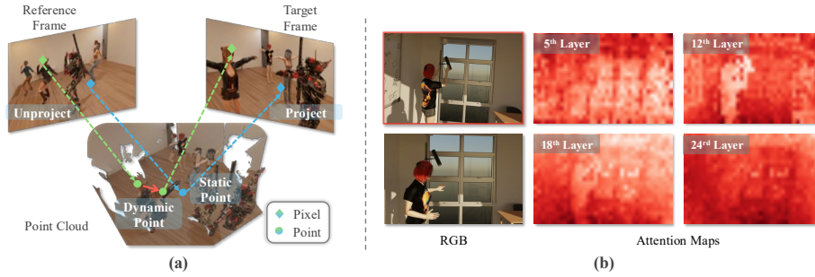
Figure 2: Motivating illustration: (a) In static scenes, geometric consistency is preserved across frames, while in dynamic scenes, moving objects violate this consistency. (b) Visualization of VGGT attention maps from the 5th, 12th, 18th, and 24th layers of global attention block with the method in Caron et al. (2021). Attention values are visualized using a white-to-red color map, with white indicating low values and red indicating high values. VGGT tends to ignore dynamic content during the feed-forward process, which motivates our design of the dynamics-aware mask.