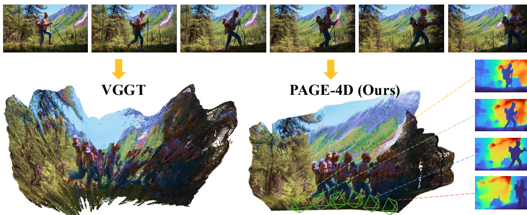
Figure 1: PAGE-4D takes a sequence of RGB images depicting a dynamic scene as input and simultaneously predicts the corresponding camera parameters and 3D geometry information—all within a fraction of a second. Compared to VGGT, PAGE-4D produces denser and more accurate point cloud reconstructions with better depth estimation quality. (Best viewed in PDF.)

5 Kempner Institute for the Study of Natural and Artificial Intelligence, Harvard University