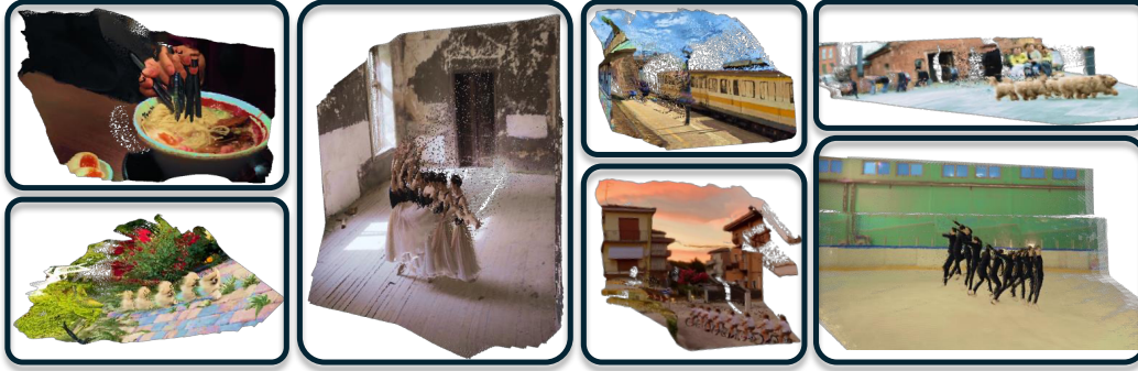
Figure 5: Qualitative Results of Point Cloud Estimation. PAGE-4D can estimate camera poses and depth maps from RGB inputs, even in the presence of dynamic objects. (Best viewed in PDF.)