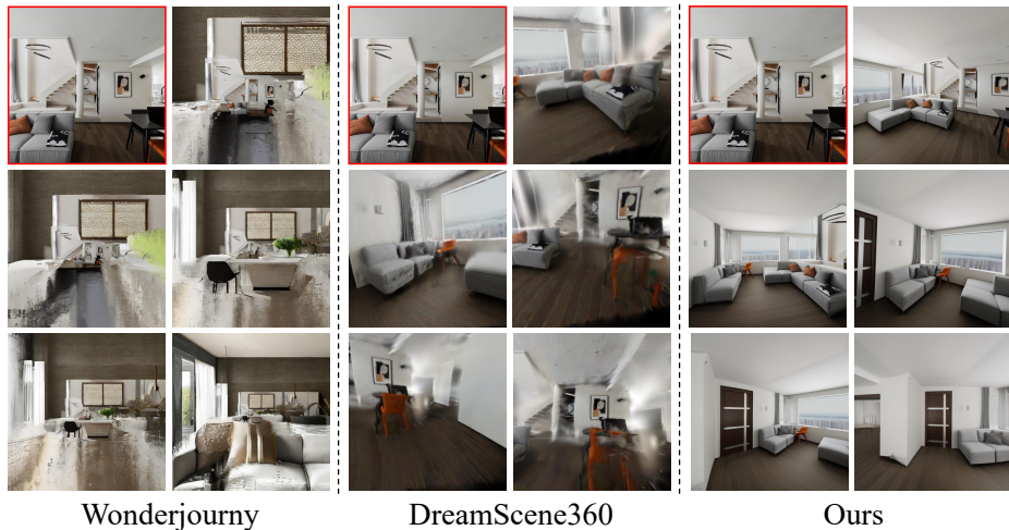
Figure 1: Comparison on large-viewpoint novel view synthesis. Existing methods such as Wonderjourney (Yu et al., 2023) and Dreamscene360 (Zhou et al., 2024) exhibit clear geometric distortions and artifacts, while our method generates photorealistic and geometrically accurate novel views. The input image is highlighted by a red bounding box. The other images represent the novel views.