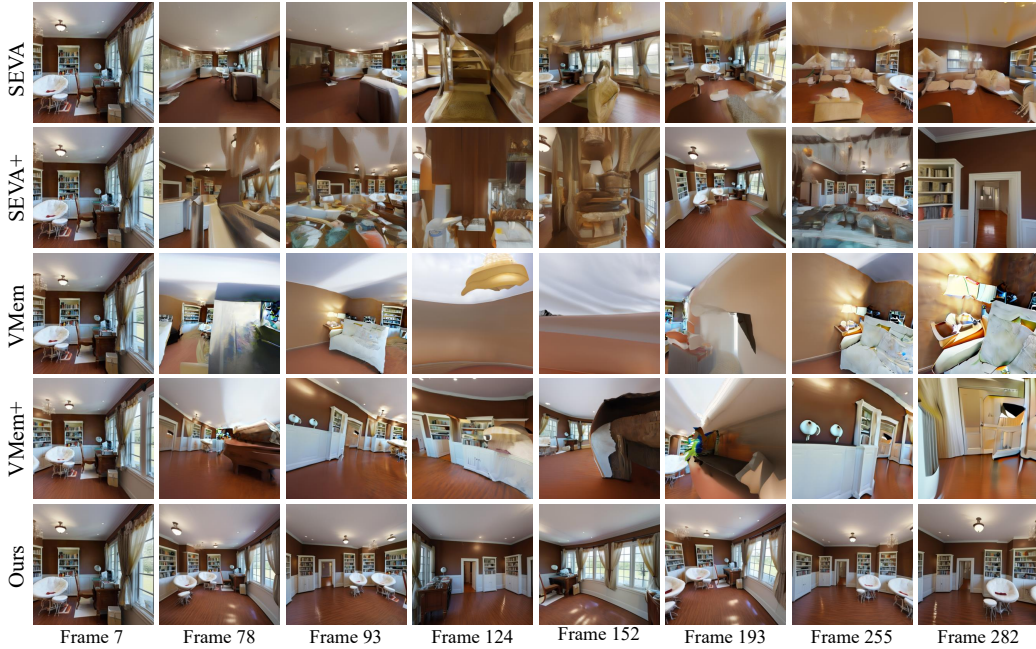
Figure 3: Qualitative comparison. Our method retains compelling visual quality and generates plausible continuations of the scene, even under large viewpoint change.