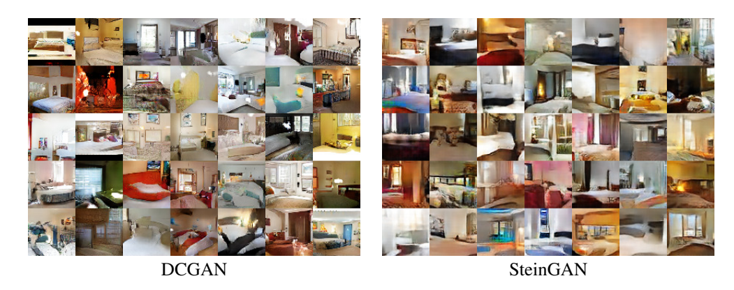
Figure 4: Images generated by DCGAN and our SteinGAN on LSUN.