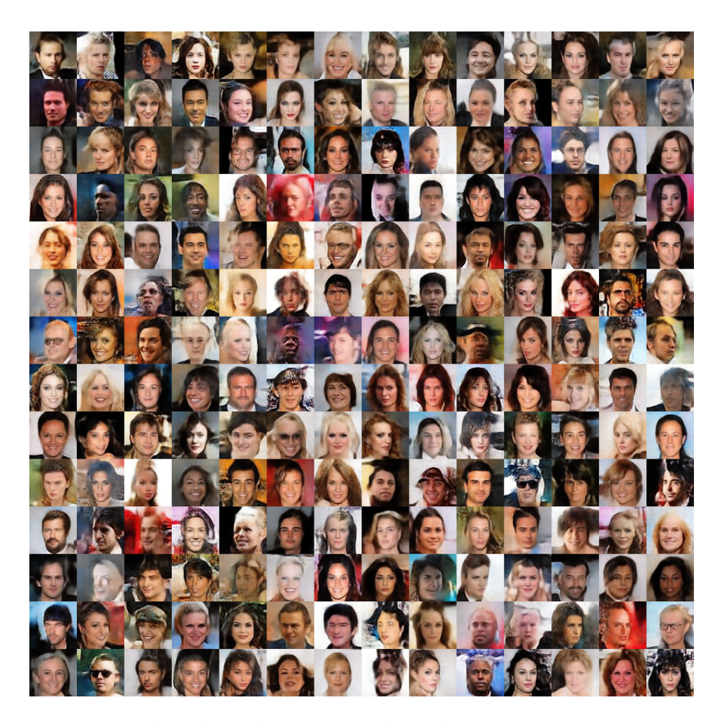
Figure 5: More images generated by SteinGAN on CelebA.