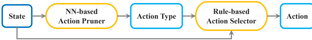
Figure 1: Overall pipeline of the two-step hybrid decision making.

Figure 1 shows the overall pipeline of our two-step hybrid decision making. The agent will receive a state s_i at each time step i . At time step i , we will first call the action pruner f_p(s_i) to select the action type A_i . Then the rule-based action selector f_s(s_i, A_i) will take as inputs the current state s_i and the action type A_i given by action pruner to select the specific action to be executed in this step.