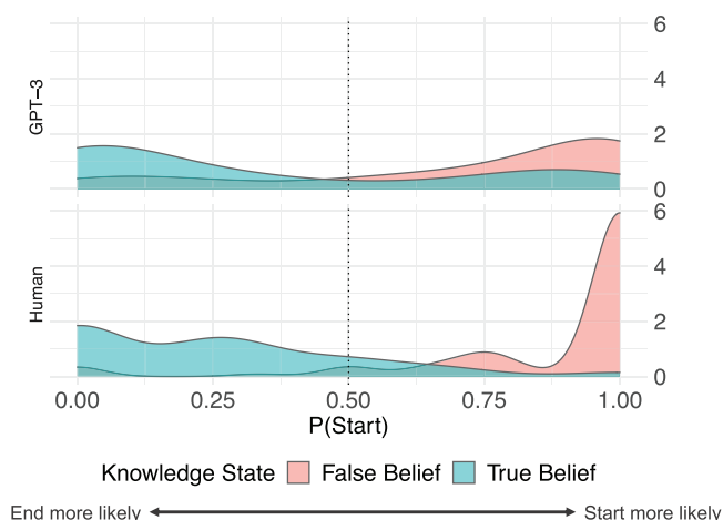
Fig. 2. Both human participants and GPT-3 were more likely to say that a character believed an object was in the Start location when the character had not observed the object being moved to the End location (False Belief). This effect was stronger for humans than for GPT-3, and there was a marginal effect of knowledge state (True vs. False Belief) in humans that could not be accounted for by GPT-3 predictions [ \chi^2(1) = 30.4 , p < 0.001 ].

highlighted by the contrast in Fig. 2: while both human participants and GPT-3 were sensitive to knowledge state, humans displayed a much stronger effect across conditions. Additionally, mean accuracy among retained human participants (82.7%) was also higher than GPT-3 accuracy (74.5%), providing further evidence of a performance gap.